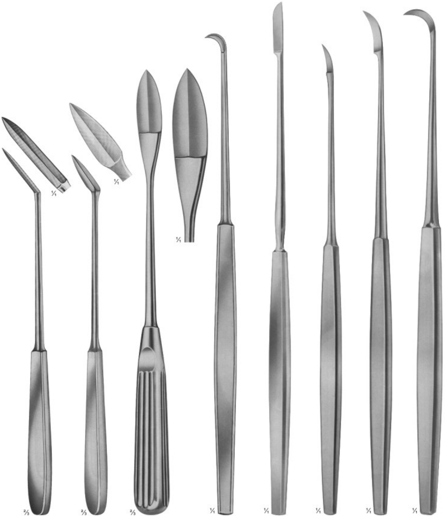
02-122 AYRE Size: 235 mm Cone Knife