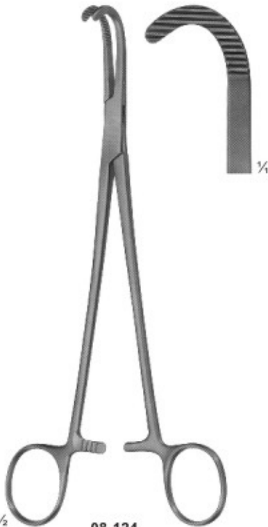
08-124 DESJARDINS Gall duct-and cystic forceps 210 mm