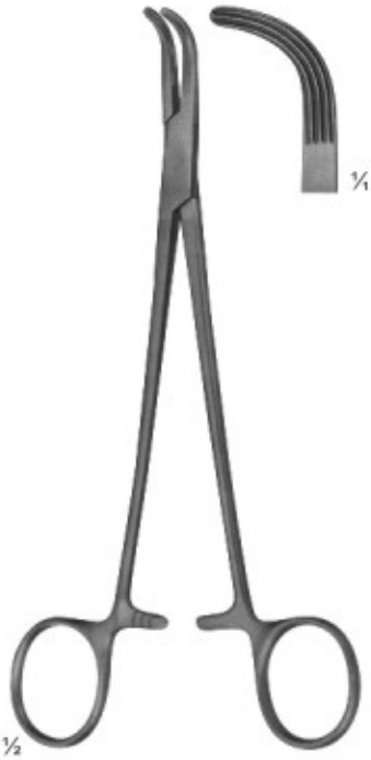
08-120 LOWER 180 mm