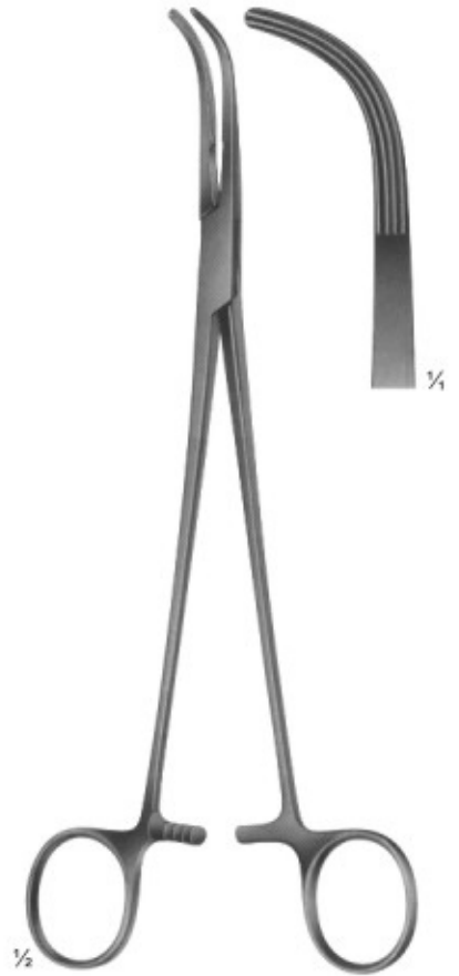
08-123 LAHEY 220 mm