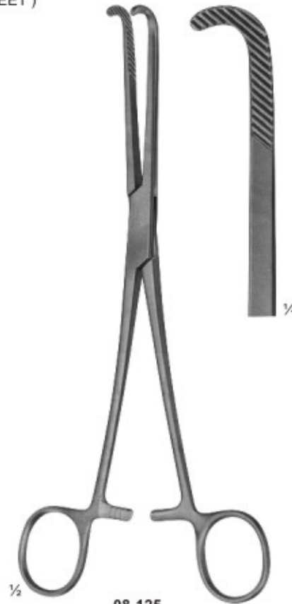
08-125 NISSEN Gall duct-and cystic forceps 215 mm