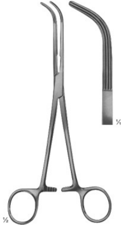
08-121 LAHEY ( SWEET ) 190 mm